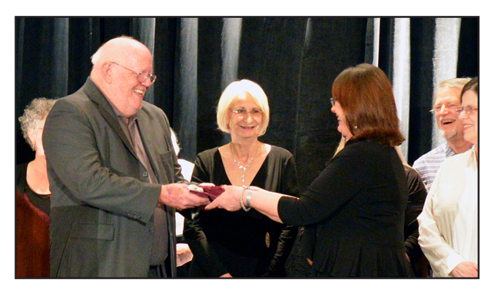
HDSCLF handed DSA flag to WSDSC.