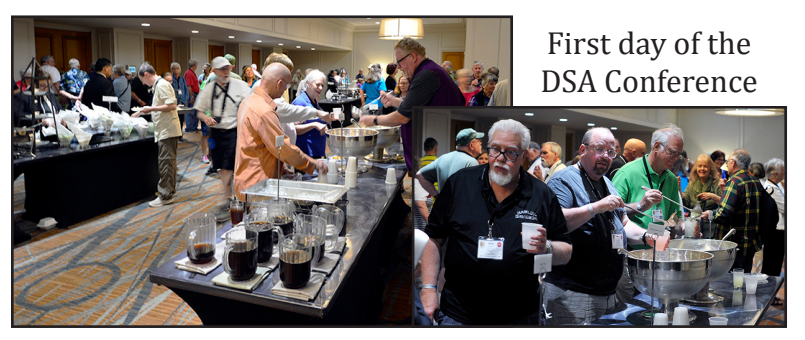
We were surprised by delicious refreshments.