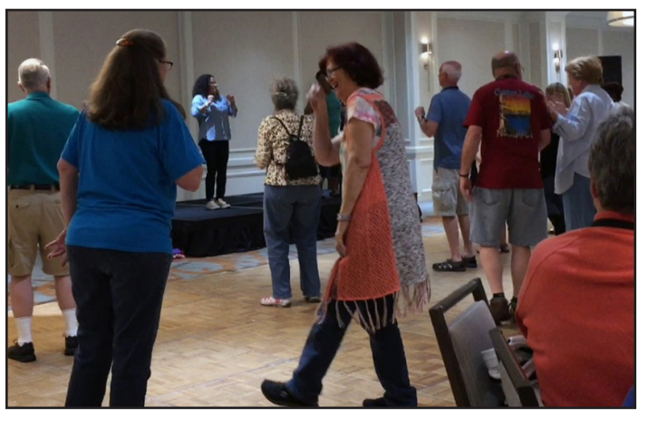
Guys and Gals trying to show off their TWO STEPS at COUNTRY DANCING NIGHT.