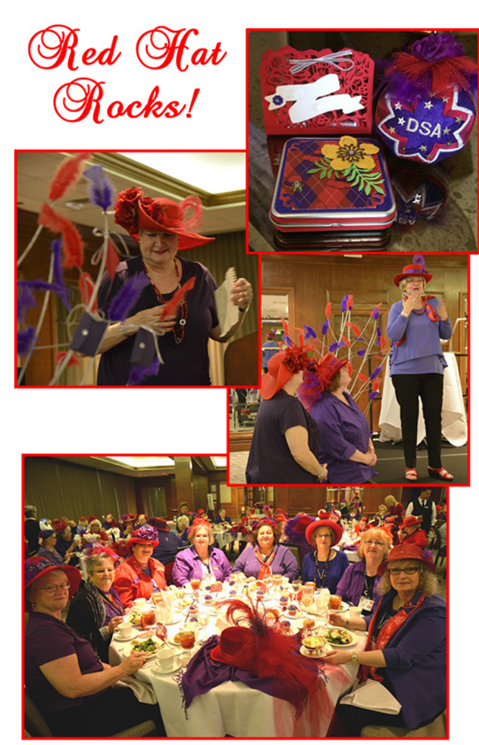
102 ladies showed off their best finery. They ROCKS!