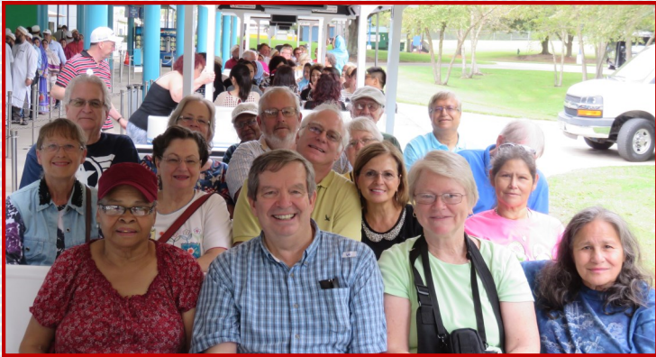
Tram Ride to the Mission Operations Control Rooms