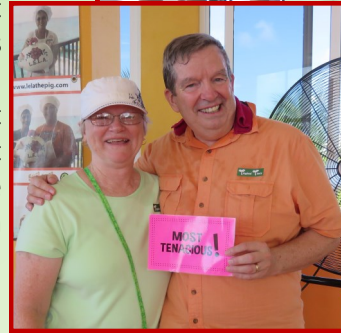
Most Tenacious Award