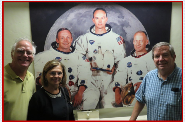
The Astronaut Gallery Wall