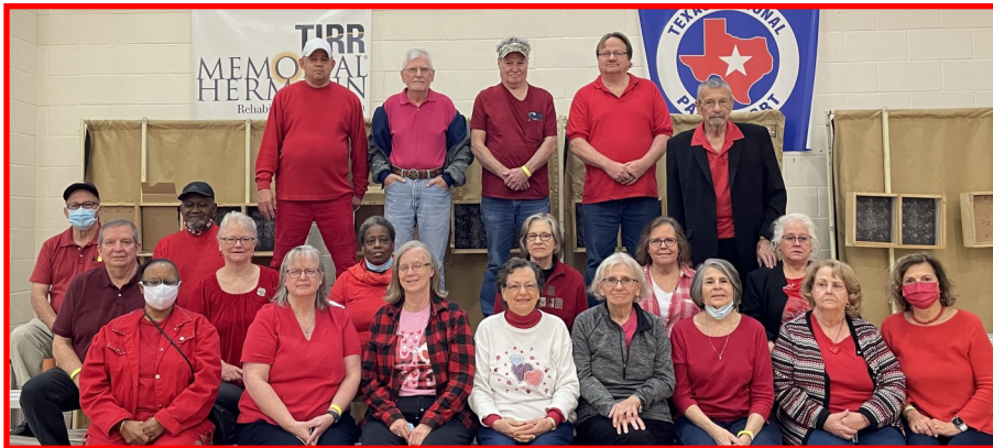
We Wore Red