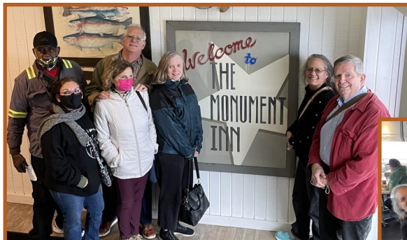
The Monument Inn Restaurant

Lastly, we went to a well-known restaurant, The Monument Inn, with delicious seafood plates.