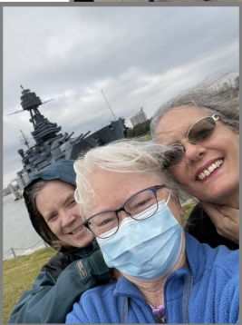
On Our Way to the Battleship Texas