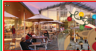
Food Court Memorial City