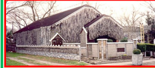
Beer Can House

Contact Person: Jim Dermon—VP 936-828-4013