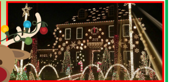
Christmas Lights Gessner-Kemp Forest