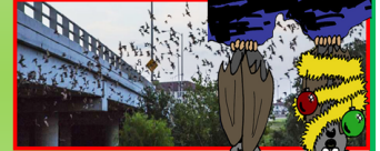
Waugh Bridge "Bat Colony"