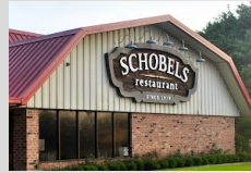
Lunch on Your Own