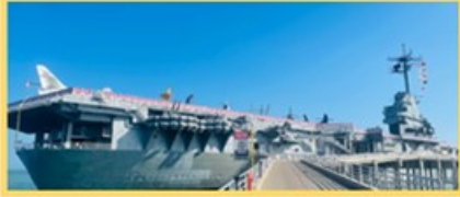
USS Lexington Museum

Cost: $140 Per Person* — Lunch and Dinner On Your Own