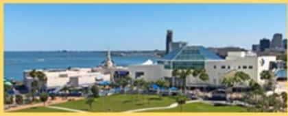
Texas State Aquarium