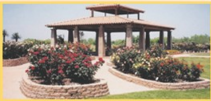
South Texas Botanical Gardens and Nature Center