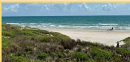
Padre Island National Seashore