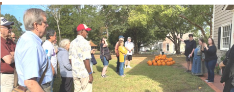
Millard's Crossing Historic Village • School House • Blacksmith • Farming