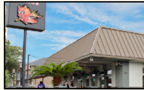
Torchy's Tacos (on your own)