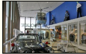
Houston Police Museum