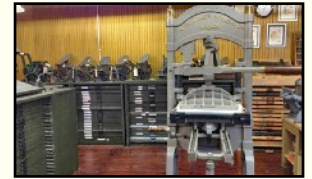
Museum of Printing History

Please meet at 9:00 am Woodhaven Baptist Deaf Church 9920 Long Point Rd, Houston