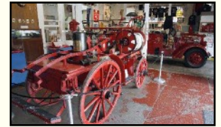
Houston Fire Museum