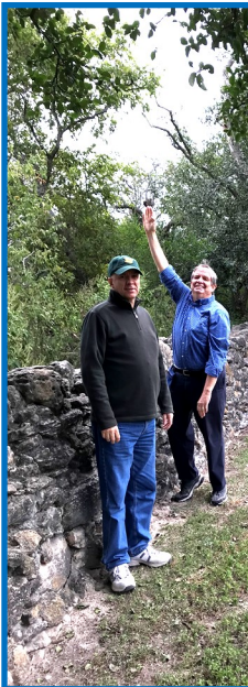
Goliad State Park—Mission Espiritu Santo