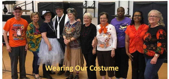
Wearing Our Costume