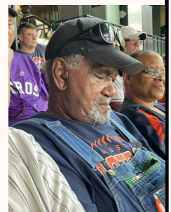
"I am not taking a nap, just resting my eyes!"

On June 15th, 29 attended a ball game at the Astros. We sat together in two rows, facing the third base. Unfortunately, it was not the Astros' time. The Astros trailed by 11 before scoring five runs in the seventh inning. The game ended with the Astros losing to Detroit, 13-5. We had a good time but were sad to see the Astros lose.